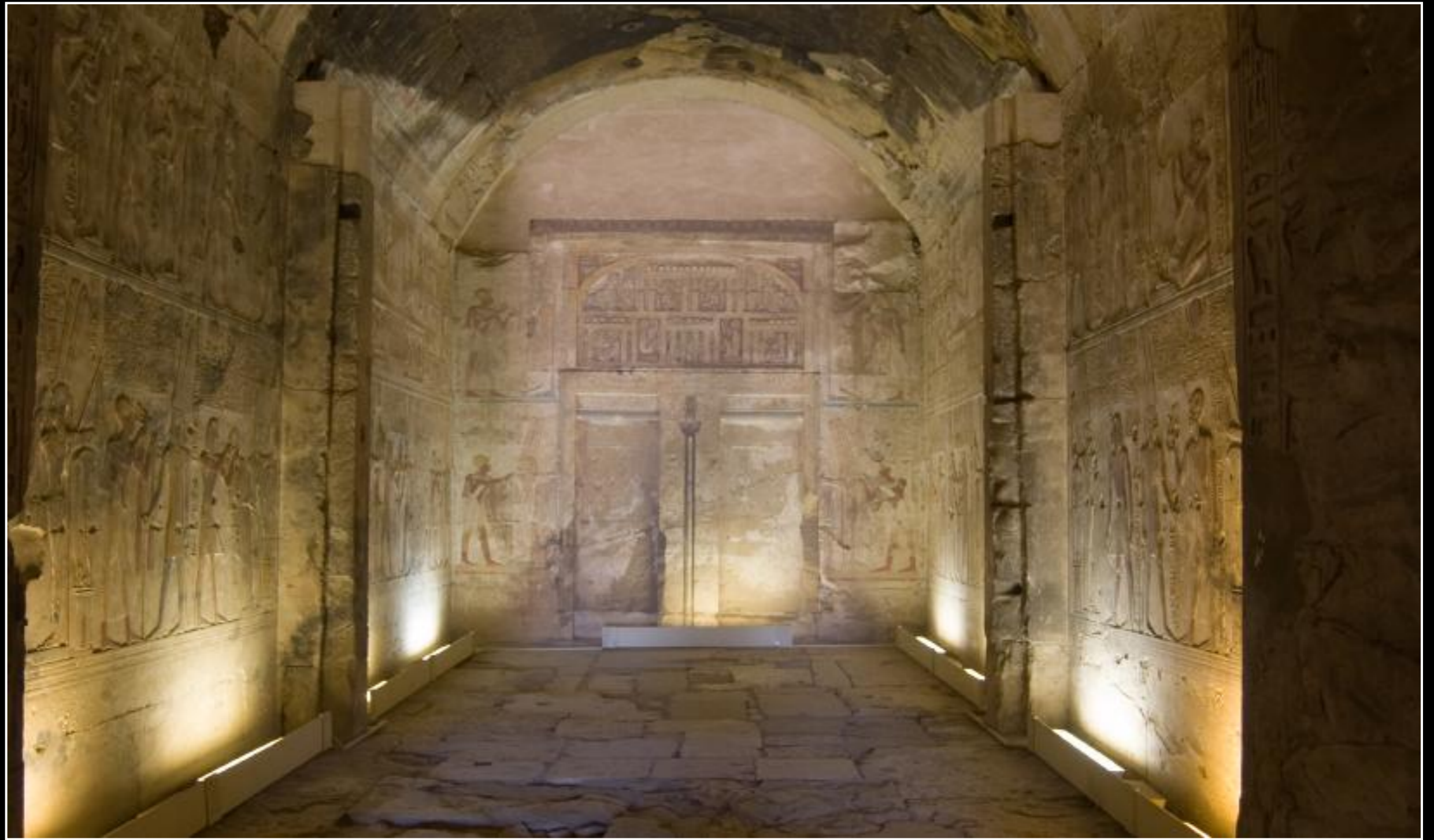
Inner Temples - Dream Realm