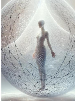
Your Source Light Energy Field- 2 nd Dimension (Indra's Net)

Your Source Light Energy Field is your 2 nd Dimensional Self. It is a membrane of Light that forms around your Soul and your body and was meant to be both a protective covering for the Soul and body, as well as a direct connection to Source above you and Source below you. Some describe this as your own personal “Indra’s net,” that endless fabric of creation possibilities that envelopes all of creation. (This is not to be confused with your Electromagnetic Field and Your Chakra System. All of that is located in the 3 rd Dimension.)