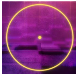
Symbol for Your Source Light Center Point – Your Soul

You came to this planet fully equipped with all the assistance you would need to both have access to your own divine wisdom AND blend and utilize it to both manage your physical life here AND offer the gifts you came to bring in a meaningful, productive, and prosperous way. This system has three basic parts: Your Soul (Source Light Center Point), your Golden Spiral , and your 2 nd Dimension: your Source Light Energy Field (Your personal Indra’s Net).